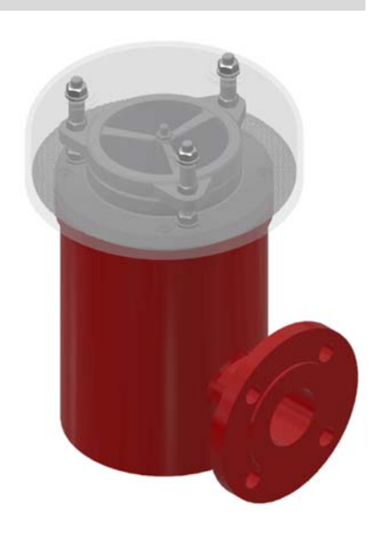
Vertical connection in size DN 100 only after prior agreement!!! On-site support of the device may be necessary!!!