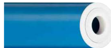
PVC tube with xirodur® B180 ball bearing