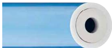
PVC tube with xirodur® B180 ball bearing