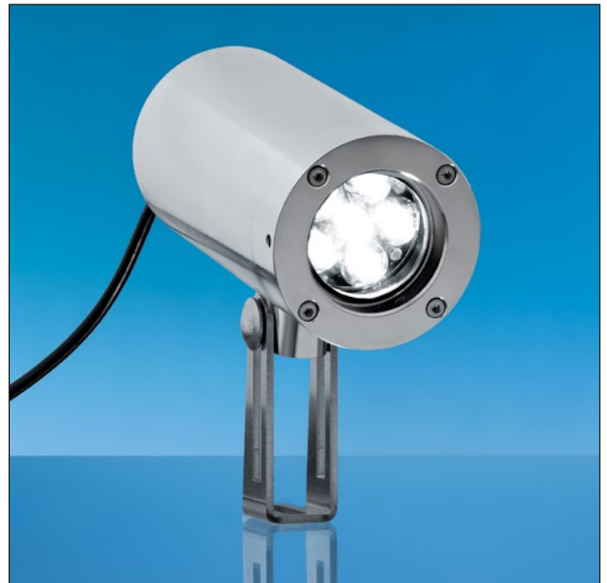
Lumistar luminaire ESL55LED-Ex